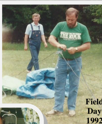
Field Day 1992