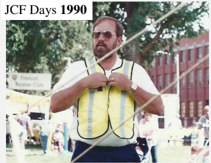
JCF Days 1990